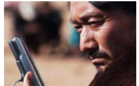
★ Mountain Patrol

The two films from the USA couldn't be more different - Maggie Gyllenhaal gives a