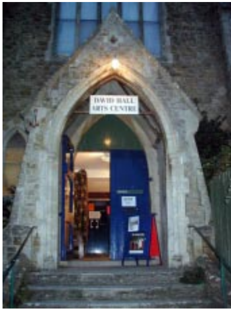
★ The David Hall, South Petherton

brave performance as Sherrybaby in a hard-hitting Indie production whilst Brit Toby Jones steals Infamous from his Hollywood co-stars, including Sandra Bullock, Sigourney Weaver and Gwyneth Paltrow, with his portrayal of Truman Capote.