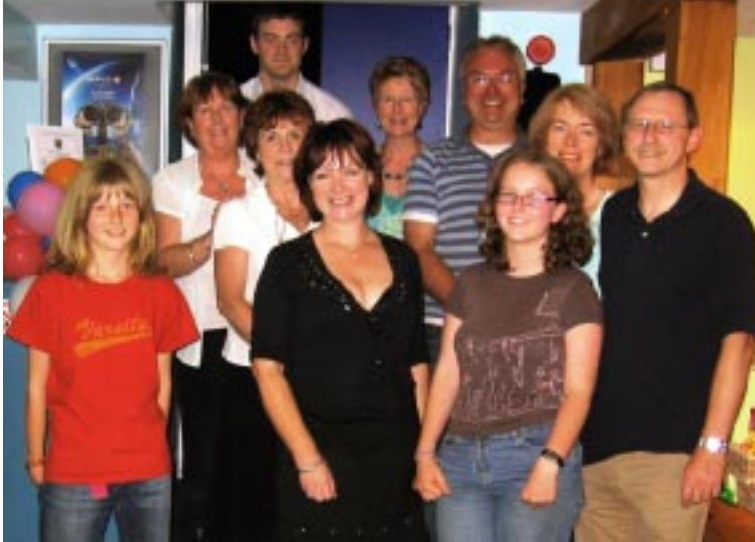
Catherine Johnson with fans and EPH volunteers