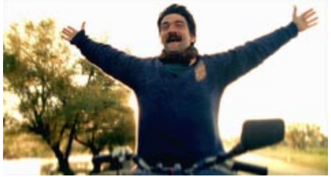
The Pope's Toilet on its way to Exeter!

The ticket price remains at £15 (concessions, £13.50, for full-time students only), a bargain for three films, lunch and tea; registration will be from 9.45 am with the first screenings at 10.30 am. The day is also a good opportunity for new and prospective venues to meet and quiz those already experienced in community cinema. So send off the application form, available as a download from the BFFS SW website, directly to Anne Hooper to arrive no later than 22 October so we can finalise catering numbers. Further details with maps of the Exeter campus are to be found on the website www.bffssouthwest.org.uk .