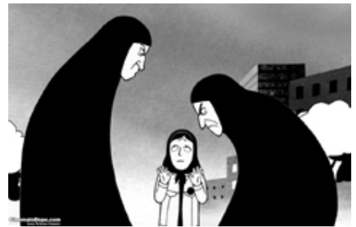
Marjane Satrapi's 'Persepolis'