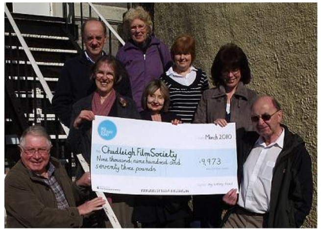
The Chudleigh Committee with the Big Lottery cheque