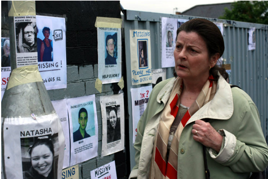
Brenda Blethyn in 'London River'

➤ Batcombe Film Society last hosted a SW Viewing in 2004 when the charming Norwegian comedy Elling topped the bill. Six years on, the film programme is headlined with something of a scoop with a screening of London River , not scheduled for cinema release until 9th July. After the WWII epic Days of Glory , Rachid Bouchareb has returned to a smaller canvas with a spare drama starring Brenda Blethyn and Malian actor Sotigui Kouyate as a couple united by the tragedy of the 7/7 bombings. London River is to be a BFFS Block Booking title along with Welcome also lined up for the 25th April event. This French tale of a Kurdish teenager's attempt to reach England was the most popular film at the ICO Screening Days in Sheffield back in November. Two titles needing no introduction are the Oscar-nominated The White Ribbon from controversial Austrian director Michael Haneke and Fish Tank which won the Outstanding British Film award for Andrea Arnold at this year's BAFTA.