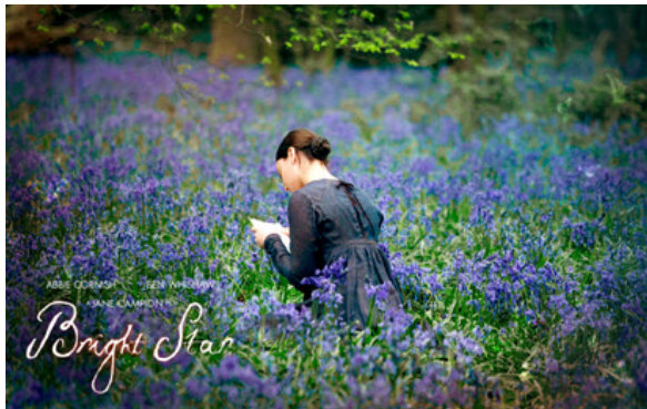
'Bright Star' screening at Langport and Bridport